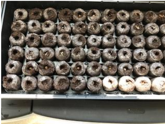
Figure 1: Life Skills B - Mini Greenhouses

The Life Skills B students have begun to prepare for the "April showers" by planting a class garden in their mini greenhouse. They will be