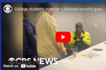
Click the image for the link to the full story!