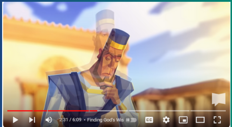
How Can You Know What's Right? Here's What Jesus Thought.

A deacon at my church once shared a metaphor from earlier Christian times that can be traced back to the sixth-century monk and hermit, Dorotheos of Gaza . It goes like this: Think of a wheel or circle. (In our modern times, we can think of a bicycle wheel.) Imagine the spokes of the wheel. As the spokes travel from the outside tire towards the hub in the center of the wheel, they necessarily get closer to one another. In this