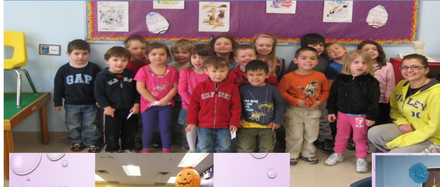
CASSANDRA MEDHURST JOSEPH BRANT WELLNESS HOUSE