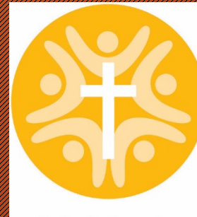
Catholic Learning Environment