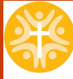
Catholic Learning Environment